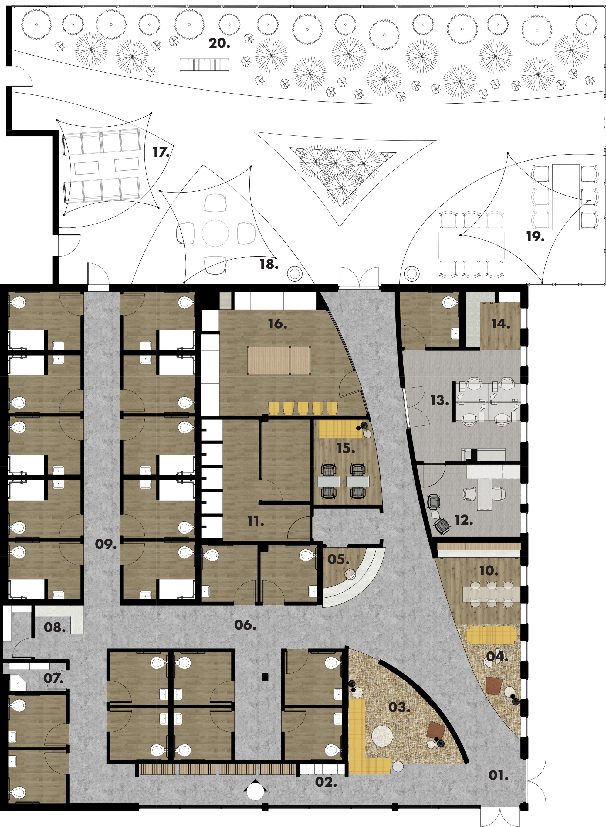
Floor Plan SCALE: 1/8" = 1'-0"

The laundry area is located toward the back of the building and is equipped with a waiting area oriented in a similar fashion, allowing users to have the choice to wait for their clothing while simultaneously having a view to the outside. An LED light that says "Trust Your Journey" is mounted on the far wall and contributes to the uplifting atmosphere. A folding table is located in the center of the laundry area to promote clear circulation and little visual obstruction throughout the space. Bright yellow and a linear design wallpaper is used to brighten up the space and add a playful aspect.