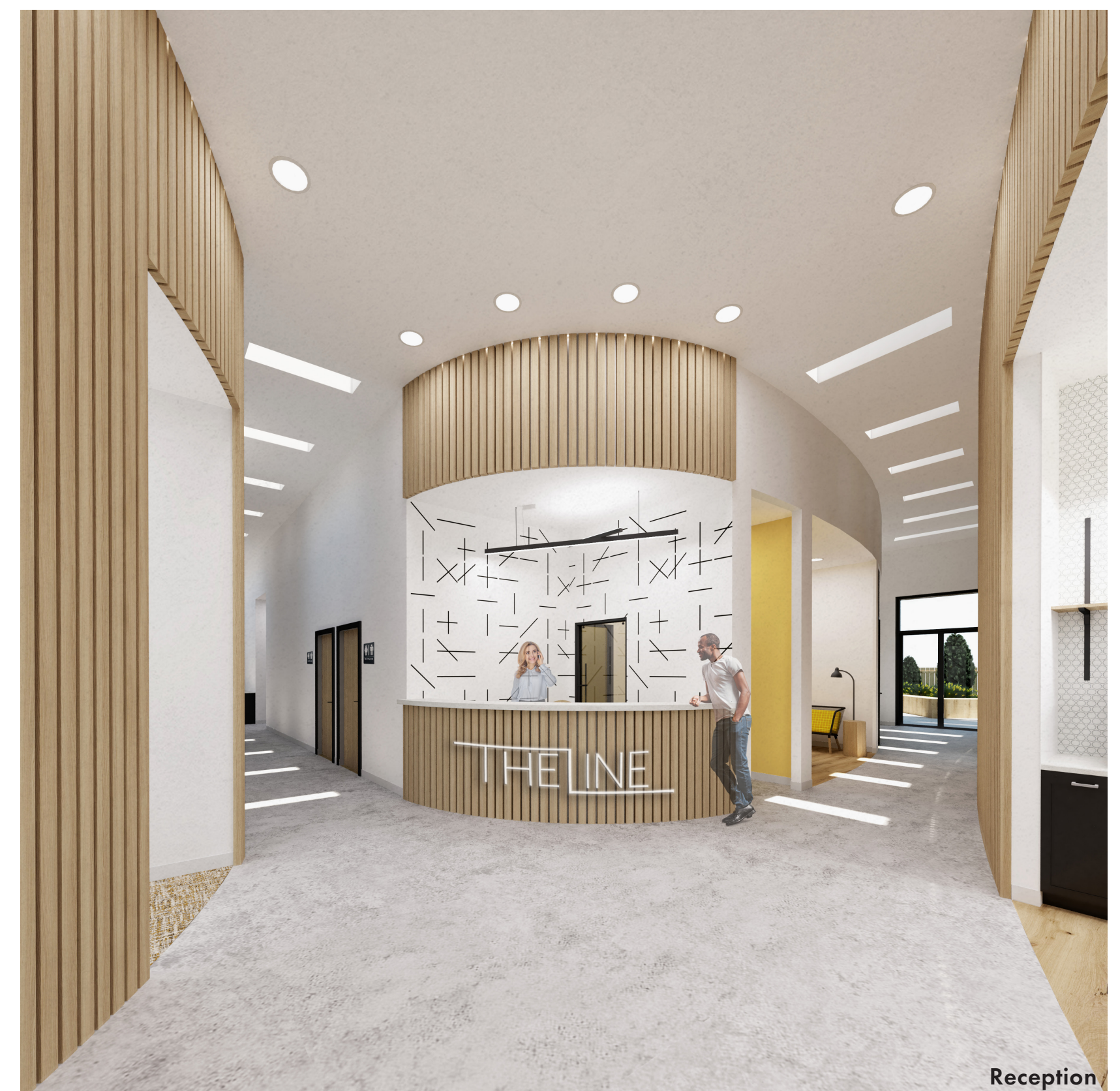
Reception The reception area is located at the intersection of the main three paths, forming a central datum point that is highly visible from multiple locations. This provides wayfinding for the user as they are first introduced to the space or travel from stop to stop within the space.

A graphic wall featuring a map of Roanoke is located along a pathway that runs parallel to the south curtain wall. This graphic is meant to provide a sense of place and connection to community for guests and people passing by.