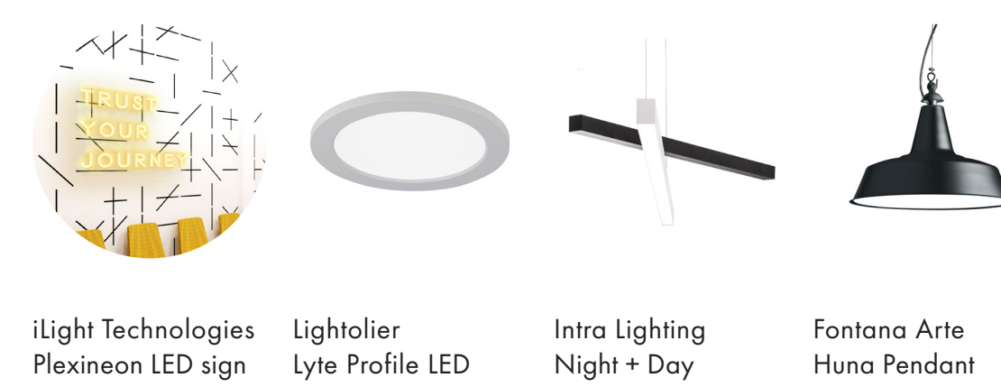
iLight Technologies Plexineon LED sign Lightolier Lyte Profile LED Intra Lighting Night + Day Fontana Arte Huna Pendant