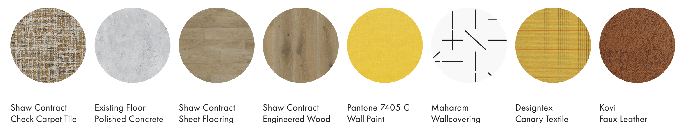
Shaw Contract Check Carpet Tile Existing Floor Polished Concrete Shaw Contract Sheet Flooring Shaw Contract Engineered Wood Pantone 7405 C Wall Paint Maharam Wallcovering Designtext Canary Textile Kovi Faux Leather

Linear elements mimic simplified forms drawn from railroad tracks. The color yellow and other warm tones are used to curate an uplifting environment. Materiality of the space as it relates to woods, metals, and leather is inspired by the woods, metals, and industrial look of railroads and their respective railway stations.