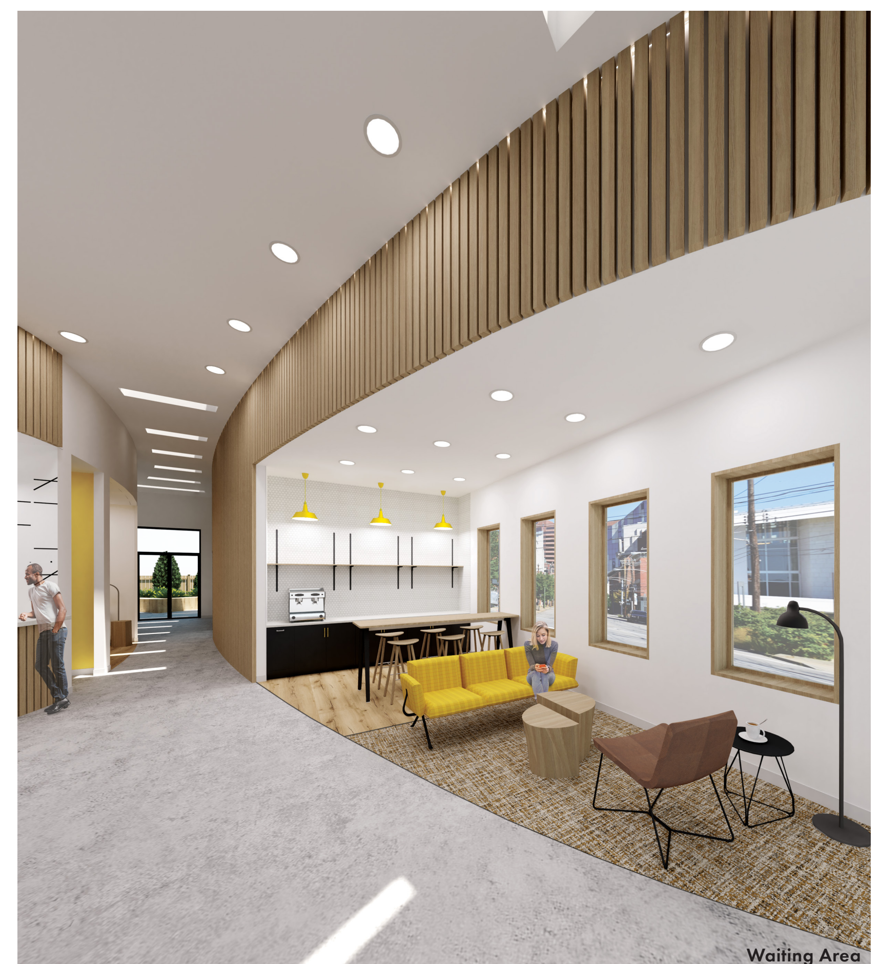
Waiting Area Upon entrance to the building, users are first introduced to a casual open waiting area and coffee bar. This provides visitors with a comfortable and welcoming interruption before they head over to the reception desk or other stops further along the way.