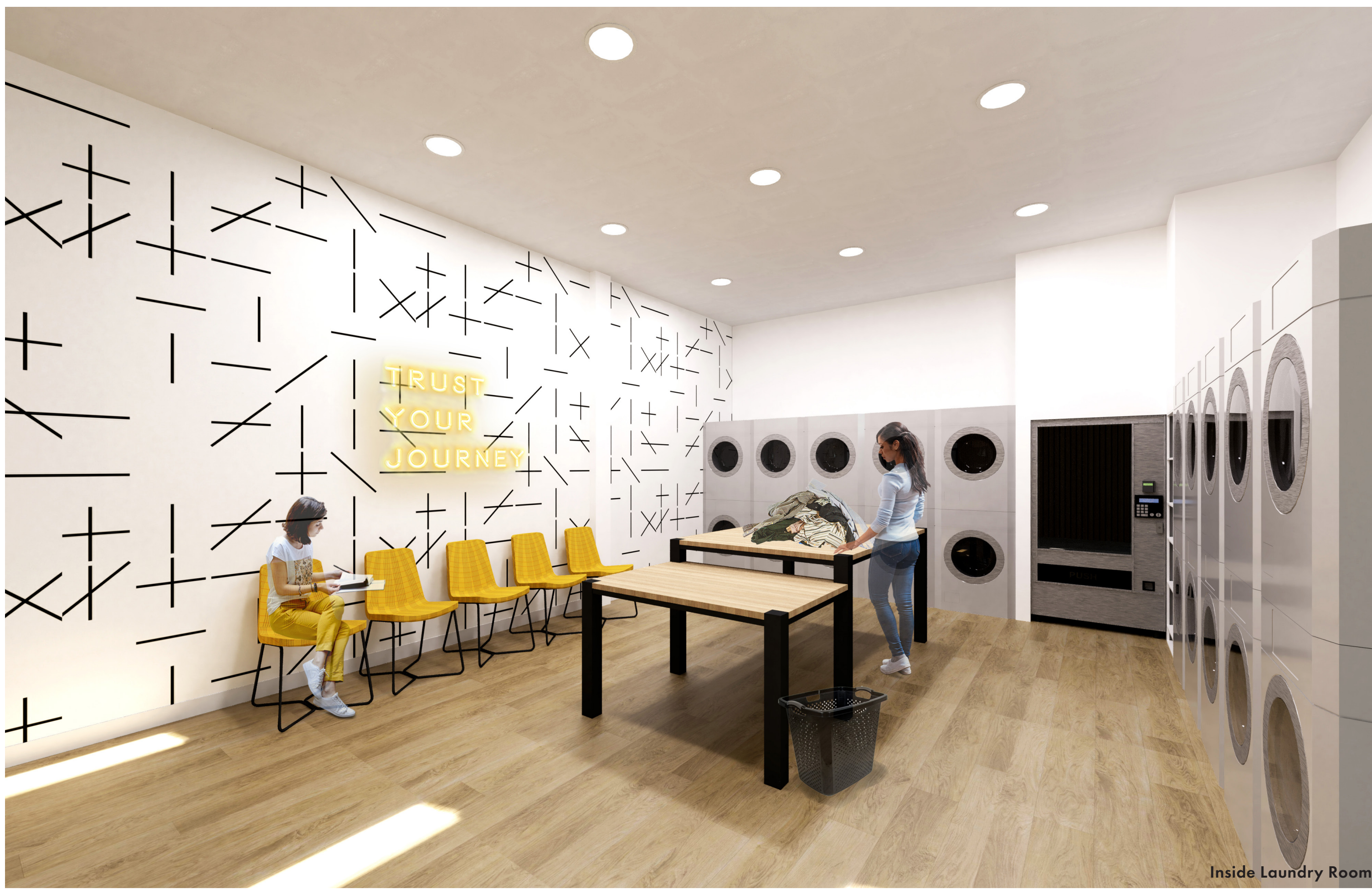
Inside Laundry Room