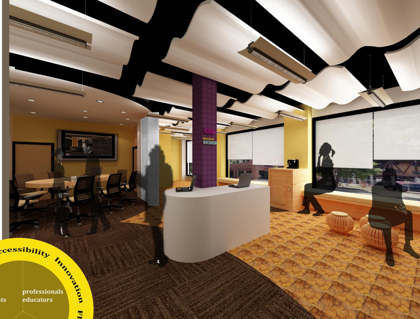
First floor reception area