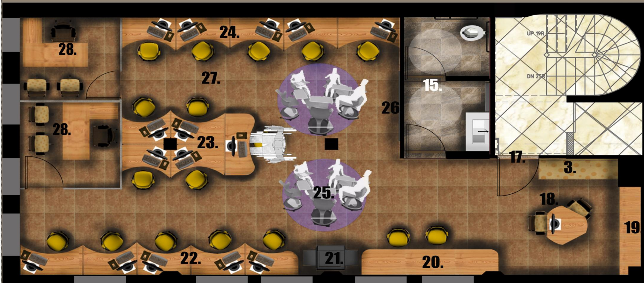
Second floor plan