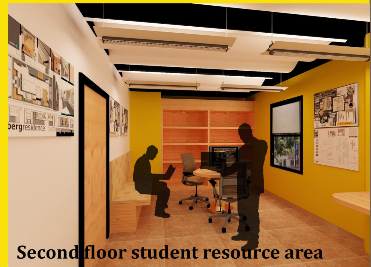
Second floor student resource area

http://quickfacts.census.gov/qfd/states/08/0827425.html