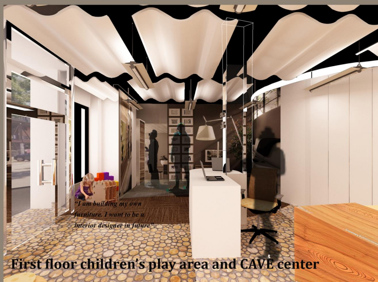
First floor children's play area and CAVE center